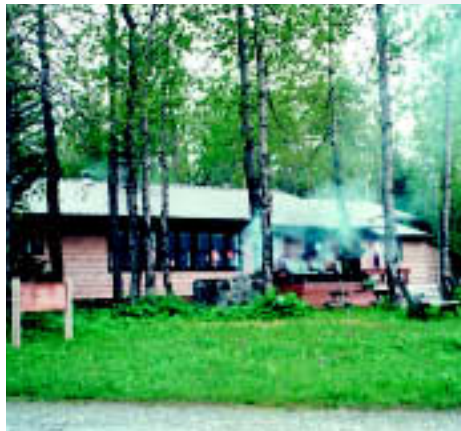
The Lodge is set on the rivers edge, watch the drama of Alaska unfold all day and night!

become the centerpiece for unforgettable trips shared amongst friends and family.