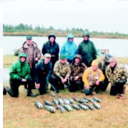
Share a true Alaska experience that you'll never forget with friends or family!

Have you ever heard stories of a river so full of salmon you could walk on their backs to cross it? Where every cast is hit aggressively by a fighting trophy? Stories like that don't usually end up to be true, though the East River may be the closest you will get to such a fable. Fly and spinner fishermen