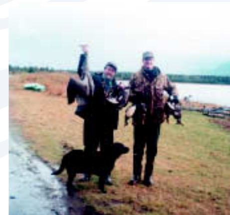
Enjoy some of the best bird hunting Alaska has to offer, early morning to late afternoon!

literally thousands of birds inhabit the waterways around the lodge before continuing their journey south.